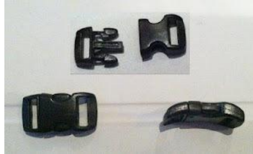
3/8" curved plastic buckle