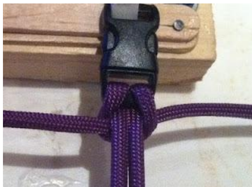
A closer look

Notice that the cord on the right points down and the cord on the left points up. These positions will alternate with each weave. Always begin your weave with the cord that is pointing down :